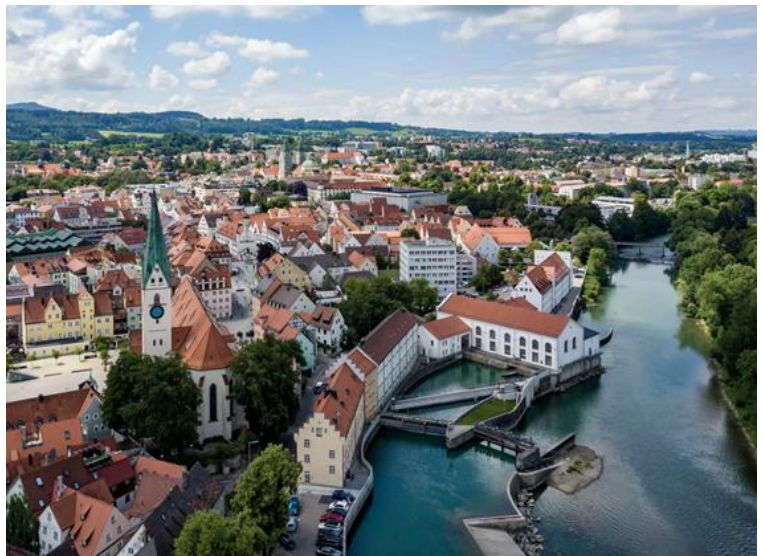
City of Kempten

Since 2012 the city of Kempten has participated in the European Energy Award (gold status certification in 2020) and already developed an ambitious climate protection strategy in 2013 which was updated in 2022 with the aim to reach climate neutrality in 2035. In recent years the city also developed a solid basis of climate adaptation related concepts. Since 2021 an urban climate study and heavy rain analysis have been available and after several workshops with local stakeholders the climate adaptation plan was adopted by the city council in 2022.