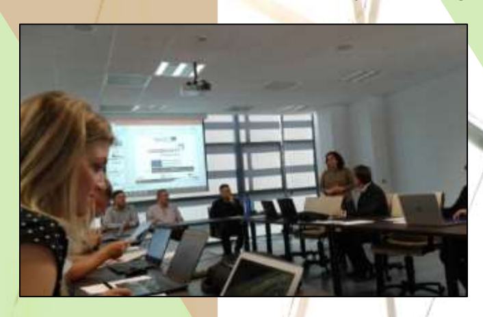
The city of Valencia

In the course of the Kick-Off Meeting project partners presented their allocated projects tasks, held Q&A sessions and discussed on the basis of sharing their experiences and current CDW management practice. The action plan of the project was thoroughly discussed and participants satisfactorily tuned into the project's requirements. Particular emphasis was given to forthcoming project activities. An action list of tasks to be carried through during the first semester of the project was charted and the meeting came to a close. The partnership is looking forward to meet again with plenty of developments, initial research activities and new ideas!